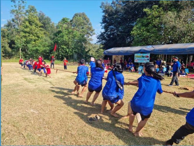
Tug of war