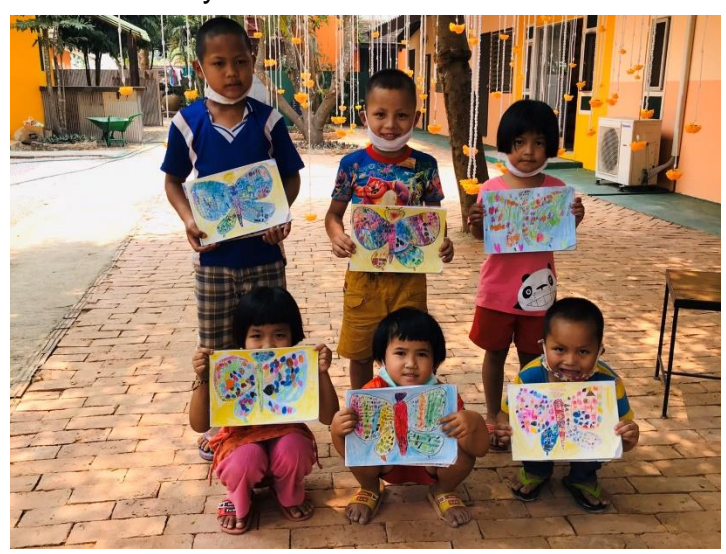
The children after fine arts lesson