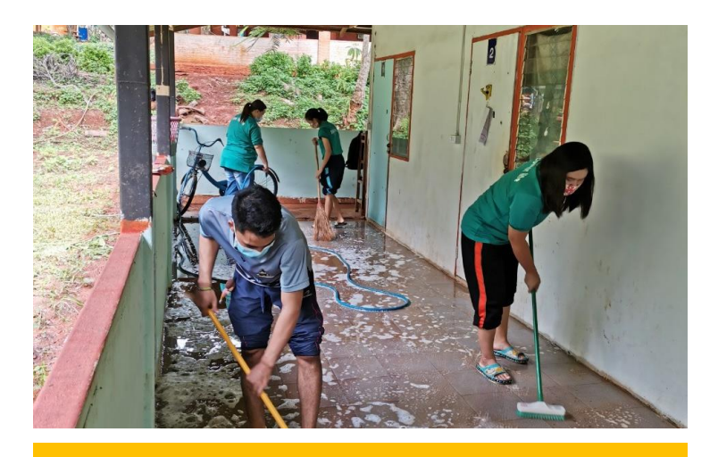
Cleaning at a Family House