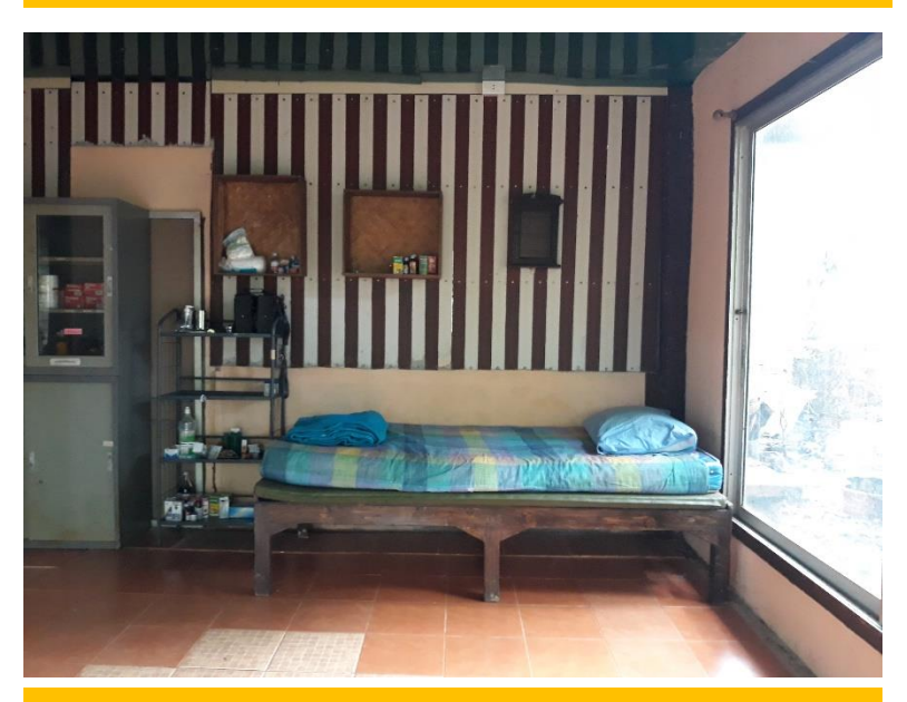
First Aid Room