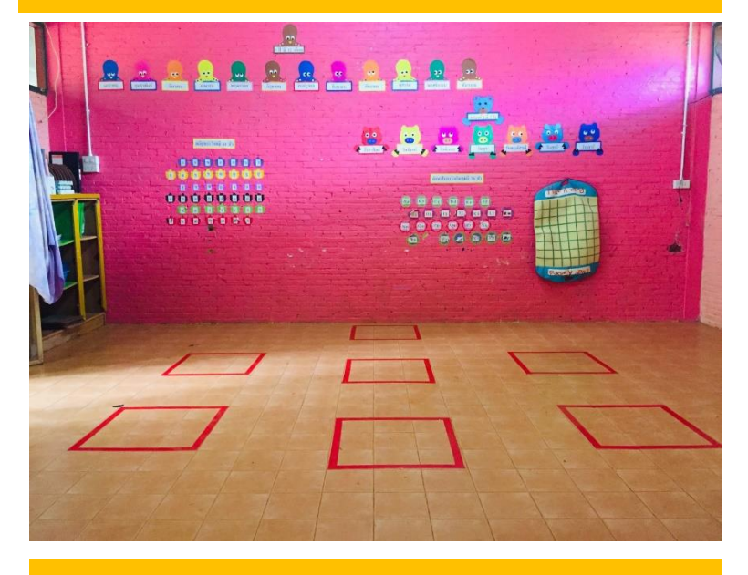
Social distancing in Kindergarten Classroom