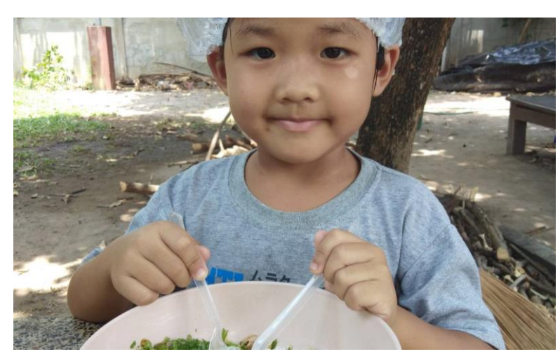
A child having a lunch with noodle soap provided by donors