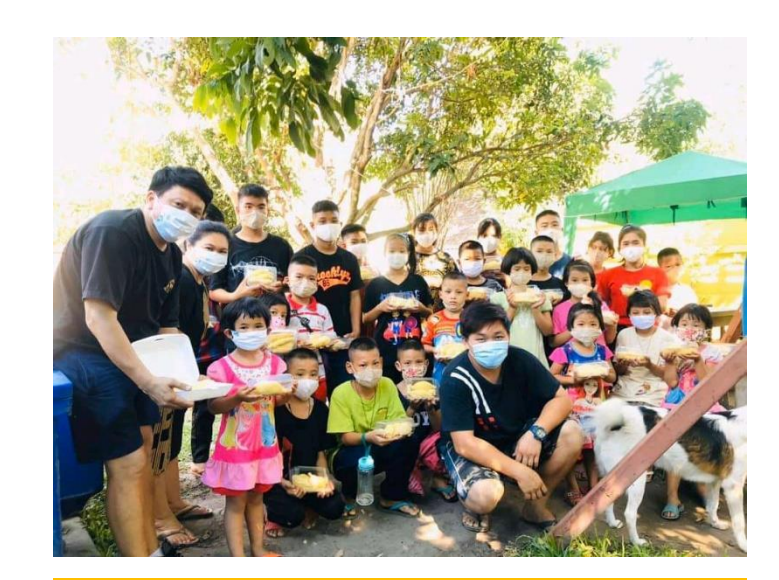
Donors with the children