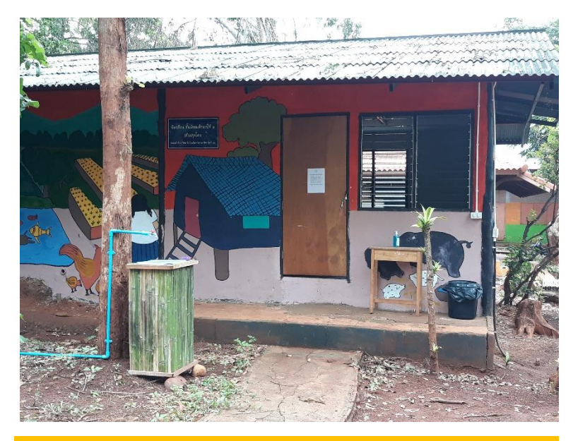
A washbasin, a hand gel bottle and a trash can seen in front of Grade-7 classroom