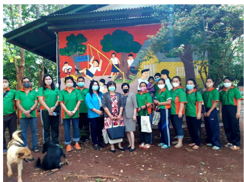
A group photo after a meeting