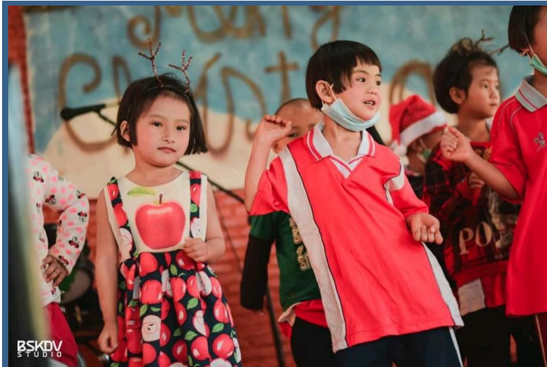
School for Life children dance on stage at Christmas