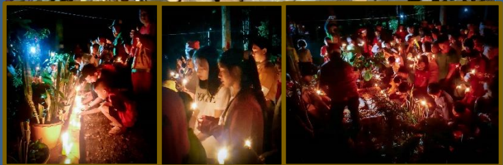
Children and teachers at the tomb for prayer