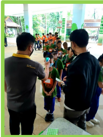
Chiang Mai Zoo