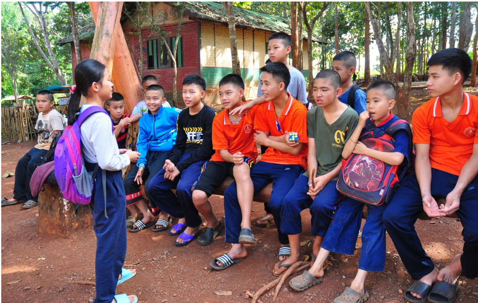
At the end of the first day, we thought that our student may find it is hard to adapt. To our surprise, they all loved here! And told us that Thai children were really warm and cheerful, they really liked it here!