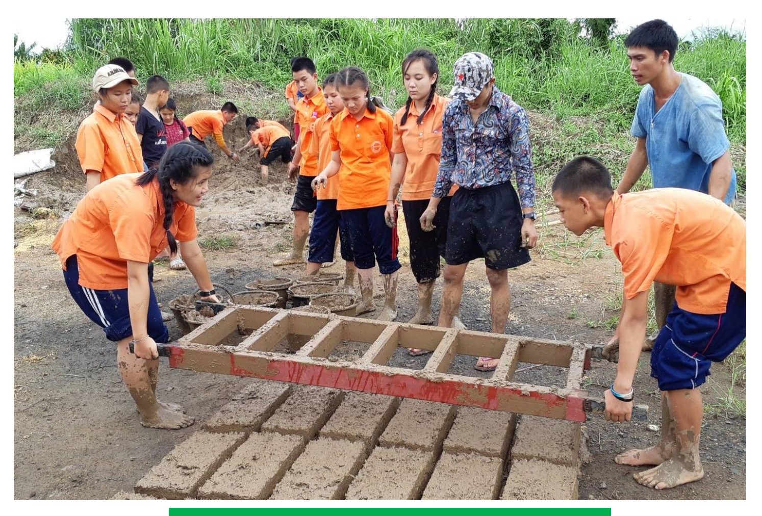
Children making clay-rice husk blocks using molds