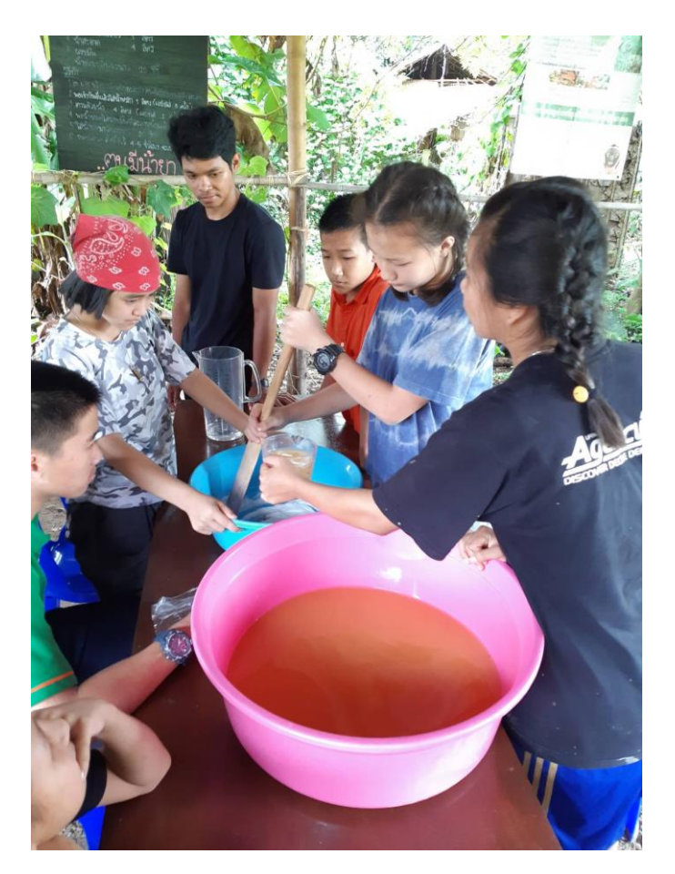
Students learning how to produce organic laundry liquid