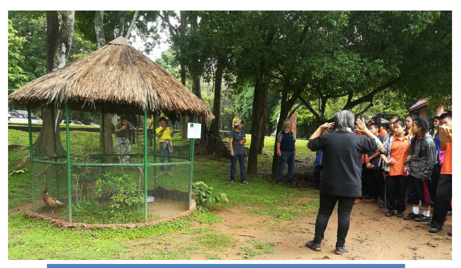
Students at Choeng Doi Suthep Wildlife and Nature Education Center