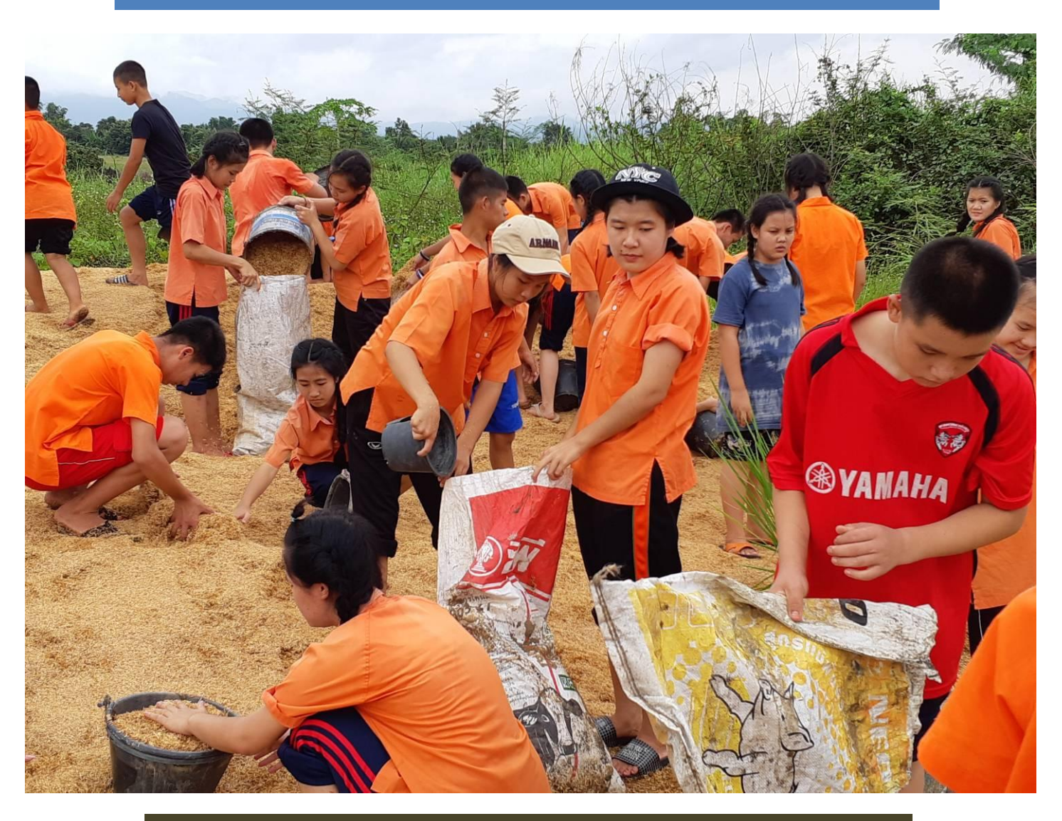
Students collecting rice husks for making clay-rice husk blocks