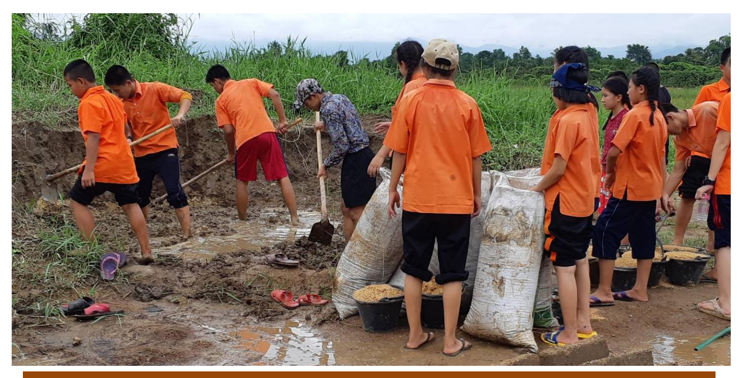
Students digging soil to get clay (above), and mixing clay and rice husks (below)