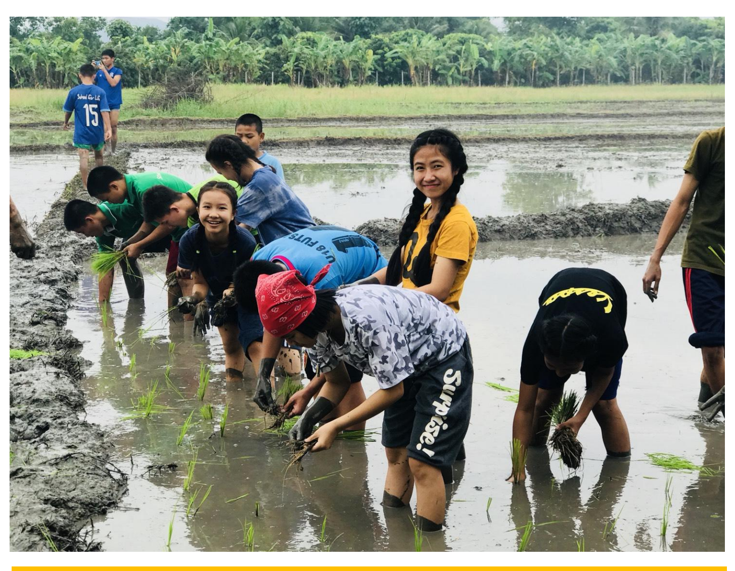
Students growing rice (above) and ploughing the field with a walking tractor (below)