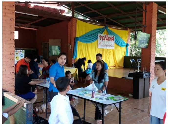
Student Registration & Parent/Guardian Teacher Meeting