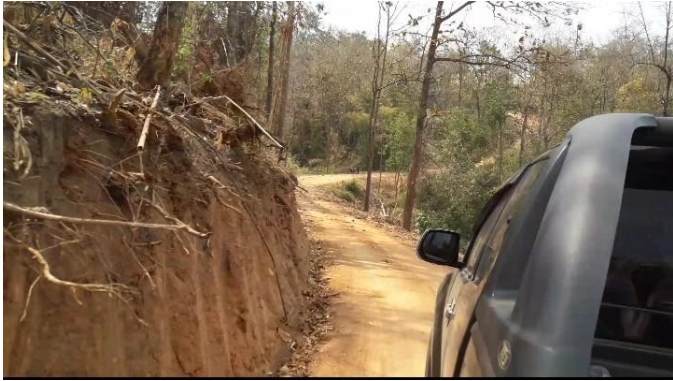
Student Selection Tour in Mae Ai District