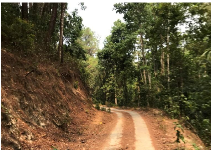
Student Selection Tour in Mae Hong Son District